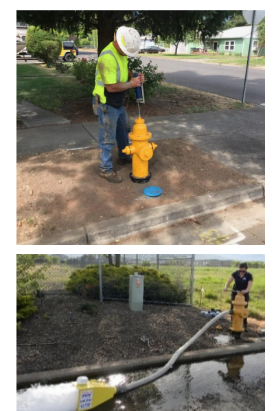
Routine maintenance such as hydrant operation and flushing helps ensure water quality from the source to your tap.

ppm, ppb: These refer to the amount of a contaminant found per increment of water. With increasing technology, contaminants can be detected in extremely small quantities. One ppm (part per million) means that one part of a particular substance is present for every million (1,000,000) parts of water. Similarly, ppb (parts per billion) indicates the amount of a contaminant per billion (1,000,000,000) parts of water.