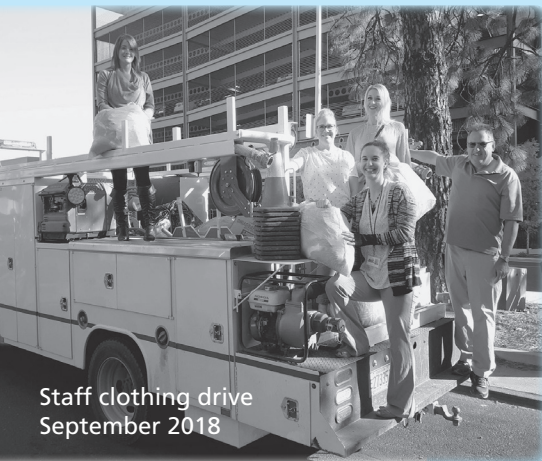
Staff clothing drive September 2018